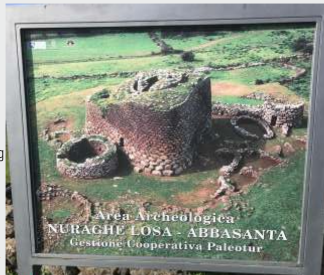
4.000 years of history archeological site of Nuraghe Losa

We are looking for work volunteers during the weeks 40, 41 and 44 in Sardinia! You can help according to your skills, and still run your race starting as last!